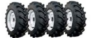
R4 Industrial Front / Rear