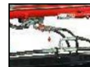
3RD FUNCTION KIT