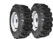
Radial Front / Rear