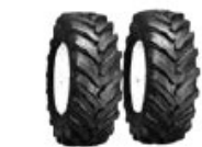
R1 Agricultural Front / Rear

Choose from a wide range of agricultural, radial and industrial tires to match your field and job needs.